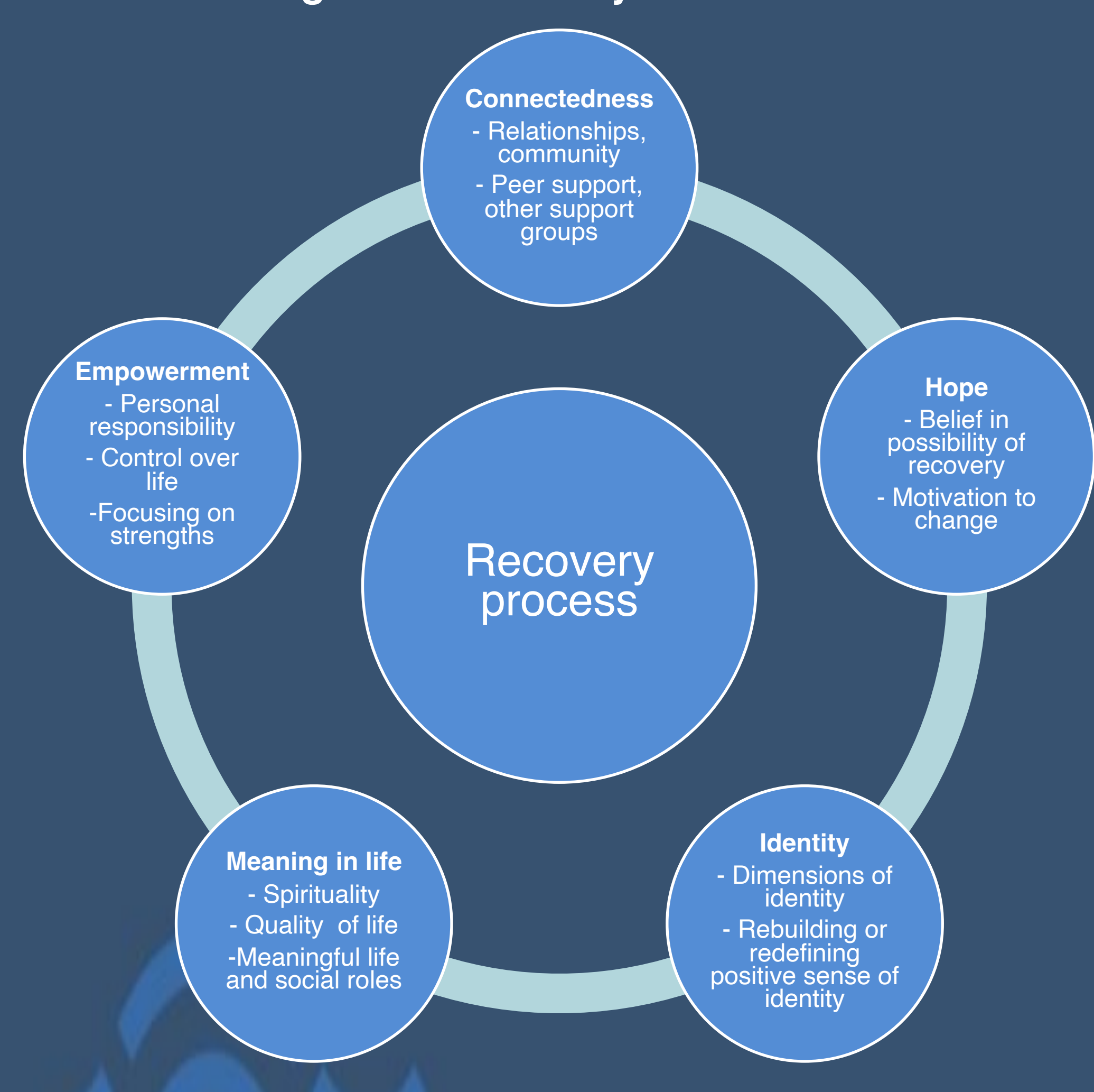
Figure 1: Recovery framework

Personal recovery has been defined as "a profound personal and unique process to change their attitudes, values, feelings, goals, abilities and roles in order to achieve a satisfactory, hopeful and productive way of life, with the possible limitations of your illness"5 (Figure 1). Personal recovery differs from clinical recovery, which mainly focuses on reducing symptoms and improving functioning levels<sup>6,7</sup>. Although clinical improvement has an impact on personal recovery, health workers can go further by cooperating collaboratively to support mental health service users in living a satisfactory, hopeful, and productive life8.