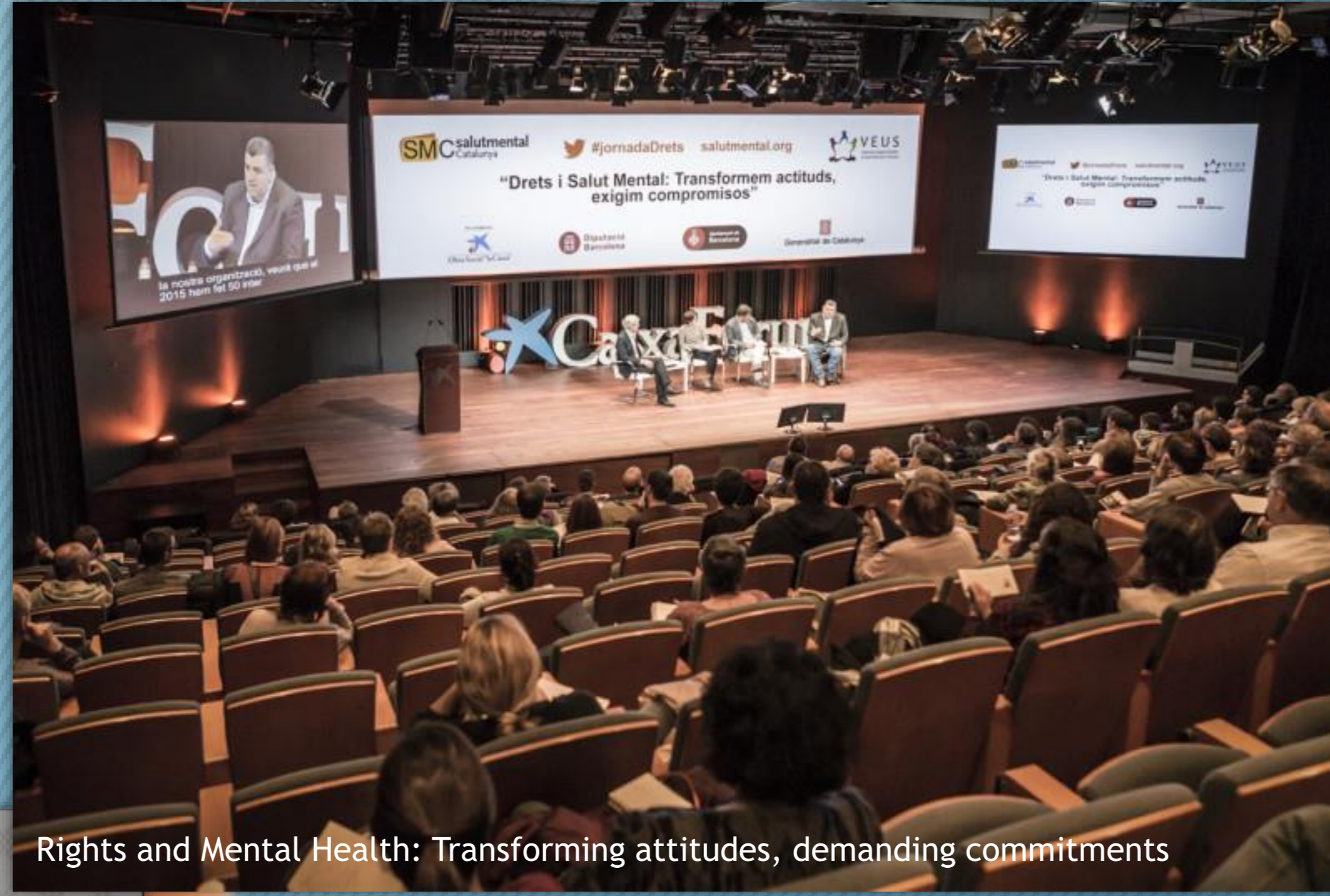
Rights and Mental Health: Transforming attitudes, demanding commitments