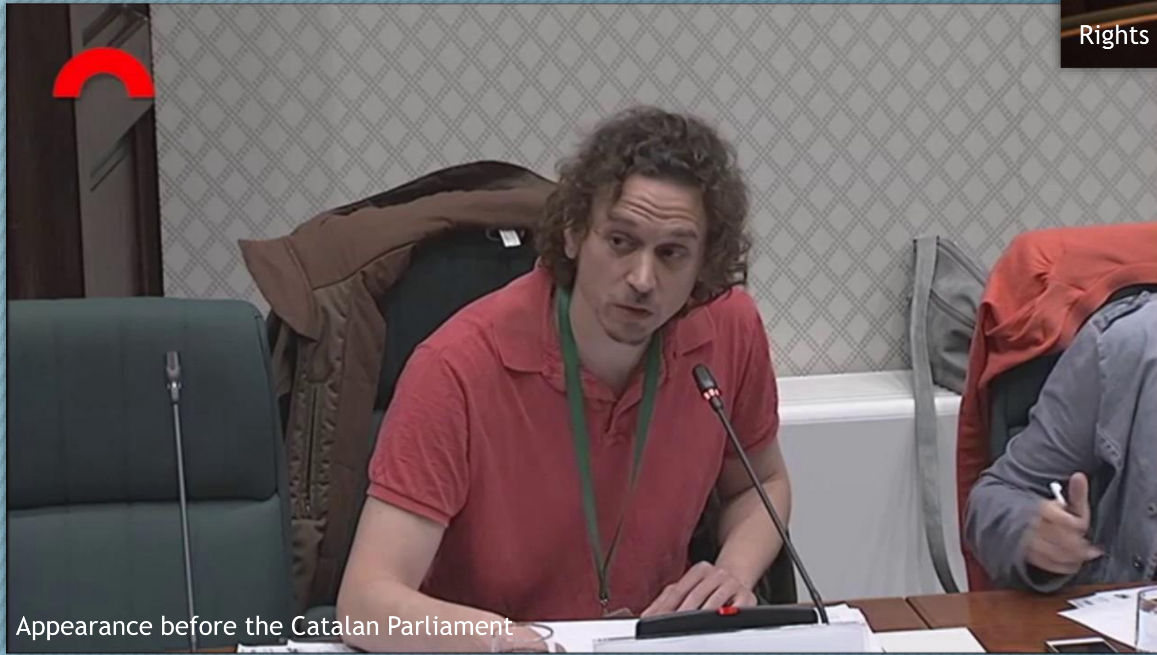
Appearance before the Catalan Parliament